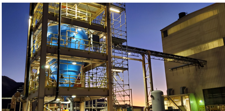
Figure 2. Mining companies and technology providers are working together to improve sustainability of mining around the world.

and becoming less dependable. This has a significant impact on water storage and harvesting, and it does not help that many of the largest mining districts are in very dry regions with local populations and farming activity that compete for a limited supply. A recent article in the Economist explained that part of the negotiation and development of the social license for the US$5.5 billion Quellaveco project in Peru came from the construction of a water reservoir, where more than 90% of the output is allotted to local farmers.